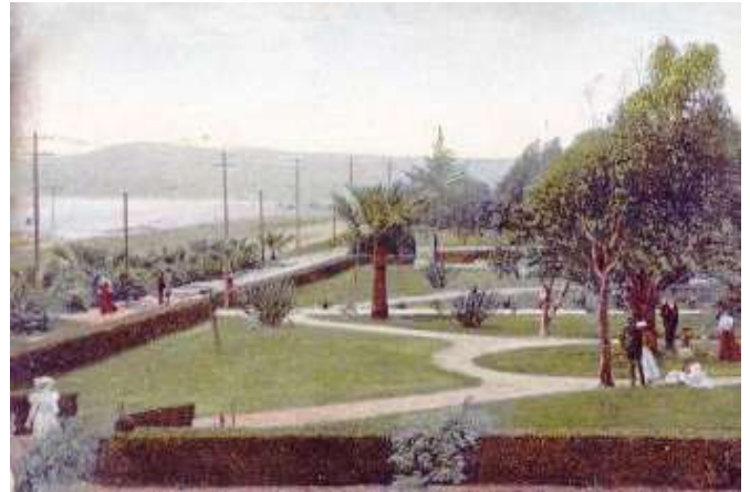
Pacific/Lincoln Park in its early days (circa 1920) looking west from Pacific Avenue. The original deed from Long Beach Land & Water Company donated it to the city to be used solely as a public park.

The transition from the name Pacific Park to Lincoln Park began in 1914 when citizens solicited funds for a statue of Abraham Lincoln to serve as a memorial to Civil War and other veterans. Unveiled and dedicated in 1915, it served as a site for Memorial Day and Veterans Day celebrations. Due to the prominence of this memorial in the park, the Legislative Body of the City of Long Beach passed an ordinance to officially name the parcel Lincoln Park, in 1921.