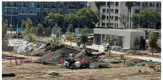
Construction is in progress for our new Lincoln Park.

We are all looking forward to having a public park available in this space once again. Follow your favorite local news for details as completion of the new park nears.